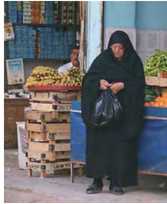
Gender Integration Workshop, Cairo, November 9-13, 2008