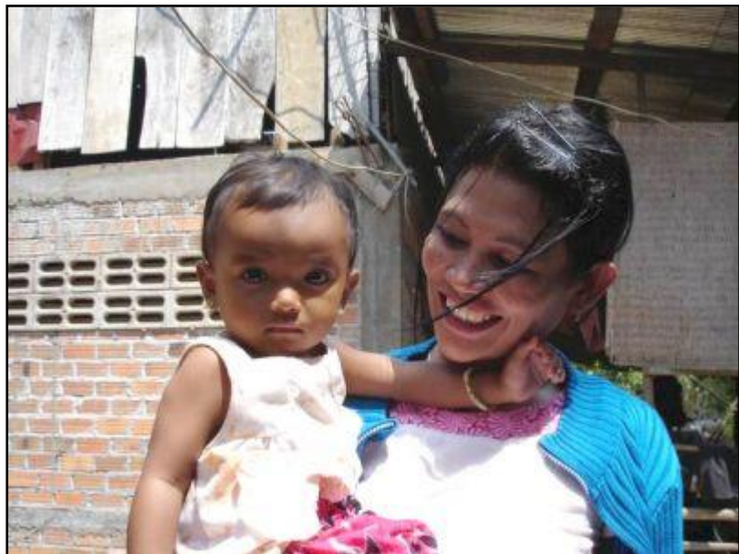
A woman plays with her niece in Battambang.

While much progress has been made in the health sector since 2006, there are many compelling gender issues that remain un-addressed. Men and women’s health and wellbeing is greatly influenced by work load, decision-making power, education, and financial means to access health facilities and pay for other goods and services that contribute to good health including food. Traditional norms and expectations that may influence their partners’ behaviors and knowledge play important roles in health-seeking behaviors. Better health also presupposes availability of sufficient numbers of quality health services and trained health personnel. The following presents a summary of findings on gender as it relates to health.