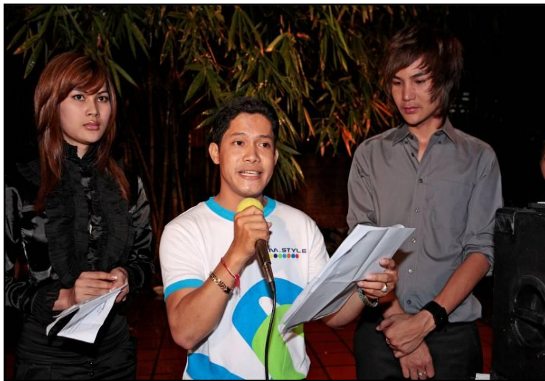
USAID launched a new campaign designed to educate men who have sex with men (MSM) about the dangers of sexually transmitted infections and prevention techniques. The campaign, called MStyle, aims to provide social support, confidential counseling and health information to young Cambodian MSM.

Gender relations and gender attitudes influence men's views of and behaviors towards women, and affects women's decision-making power and their abilities to avoid risks and reduce their vulnerabilities. While knowledge about reproductive health, HIV/AIDS and health care among men and women has been improved, behavior change among men lags.