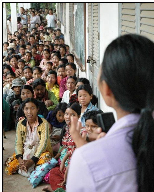
USAID's Maternal, Newborn and Child Health (MCH) programs are working to improve the quality and accessibility of MCH services and build the capacity of caregivers, policymakers and community volunteers.

This section presents the findings as they relate to gender in governance including elections and political parties, with a special focus on youth and politics, and the justice system. It is followed by a section on gender and trafficking in persons.