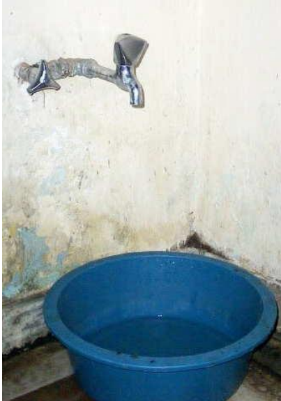
Water Supply in Ministry of Information and Culture Kindergarten

School rehabilitation was not spread equally around the country. Only one girls' school was in a Pashtun area and Herat received eight of the twenty rehabilitated facilities. U.S. forces were positioned in Herat at the time and there was a close partnership with the Governor, Ismael Khan. 16 In Mazar-i-Sharif, the Sultan Razia girls' school (IOMKBL006) was selected for rehabilitation because it had been occupied by the Taliban and then bombed by U.S. forces. The school required extensive renovations as did a teacher training facility (IOMKBL006) in Kabul. The Sultan Razia school and the teacher training facility consumed 32 percent funds committed for school rehabilitation this period.