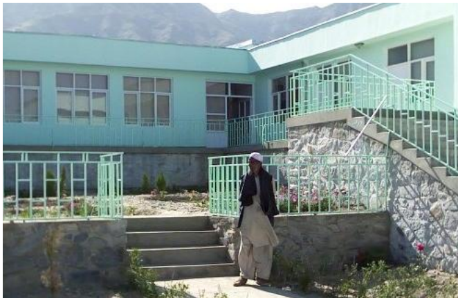
Parwan Provincial Women's Center

Women's programming received about five percent of overall support in this final phase of OTI programming. Grants were mostly for small-scale income generation training. A $3,000 grant to make toys for kindergartens was also approved. The toys were welcomed at the centers, but the publicity surrounding the distribution of the toys far outweighed their economic and social value. 35 The Ministry of Women's Affairs received $11,000 to celebrate International Women's Day 2004, and rehabilitation work began on the women's center in Faryab province. The WRC represented the largest grant targeting women – $60,000. The WRCs left unfinished as of June 30, 2005 were handed over to USAID for completion.