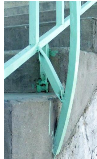
Parwan WRC: Weak support on railing