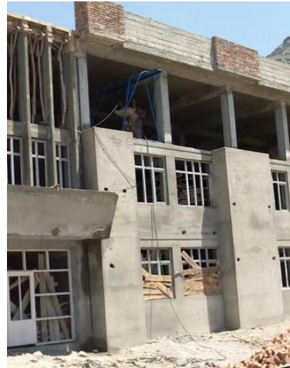
Two years' construction results at the Omara Khan School in Kabul

Invest in rehabilitation, not new construction. Construction of new facilities is generally beyond the timing and scope of a two-to-three-year OTI program. The Omara Khan school in Kabul, the women's resource centers, and the Women's Agricultural Training Center in Helmand faced difficulties in construction, safety, usage and land deed acquisition. New construction tested the bounds of OTI's abilities, made even more difficult by the fact that OTI had no international engineers on staff. OTI-funded rehabilitation work was sometimes as problematic as new construction, but OTI has more flexibility when dealing with additional months to rehabilitate a facility, not additional years to complete new construction. Moreover, OTI should invest in rehabilitation to produce quality work since ministry buildings and schools are permanent government structures whose functionality will impact the legitimacy of a government for years.