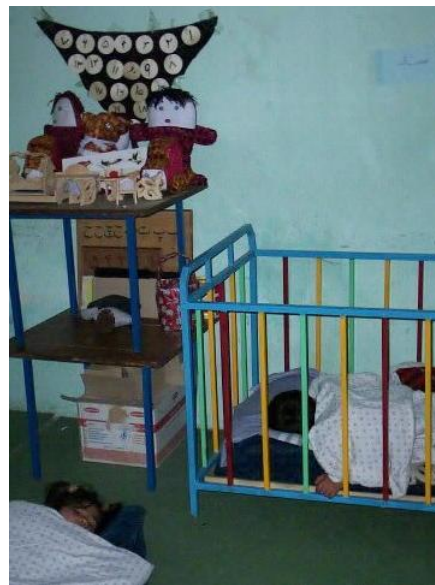
Children in Ministry of Agriculture and Livestock Kindergarten (donated toys on shelf)

Kindergartens are important facilities for women and are regarded as highly safe places for children. OTI recognized the importance of such facilities and provided priority funding to Ronco 21 to rehabilitate kindergartens in five ministries: Agriculture and Livestock, Information and Culture, Rural Rehabilitation and Development, Reconstruction, Water and Power. The $55,000 committed, however, does not reflect a high level of commitment nor was it sufficient to fund high quality rehabilitation. Three years on, the repair work is unsatisfactory – with leaky roofs and pipes and broken door handles the norm. Much of the damage is not from normal wear and tear and appears to have been the result of low quality building repairs. Water supply was a problem in kindergartens visited at the Ministry of Agriculture and Livestock and the Ministry of Information and Culture. Neither kindergarten has a facility or room for washing and changing children even though there are 70 to 100 children per facility. Women at the Ministry of Agriculture and Livestock carry water to the building. Despite the difficulties, the Afghan women staff keeps the facilities remarkably clean.