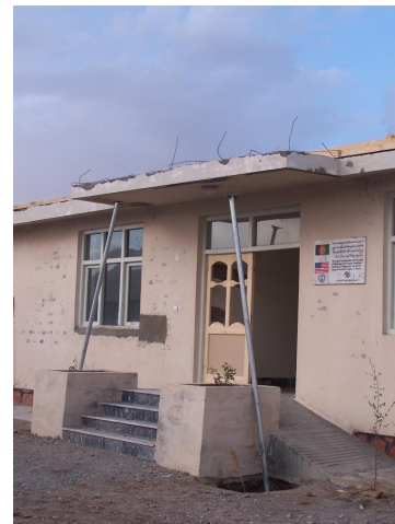
Problematic Construction at Gardez Provincial Women's Center

The training facility at the Lashkar Gah hospital hosts three-year nurse training programs for men and women in separate classes. At the time of the evaluation team's visit, the students were taking year-end exams. The facility was well-constructed as was the nearby women's agriculture training institute. However, no women were seen at the agriculture institute and it did not appear to be the site of ongoing training. IOM staff confirmed that in four visits they had not seen any women at the center, either. A report from Mercy Corps (IOMAFG071) shows photos of women in training, though it notes that only three of fifty women reported that the training would impact their income. The institute includes a large agricultural plot, but it appears that men are now using the facility to incubate and hatch hundreds of chicken eggs and grow vegetables for their own income generation purposes. The institute may be more beneficial as a mixed facility, with courses alternating for males and females, but it is unclear who is running the compound and how it is being used.