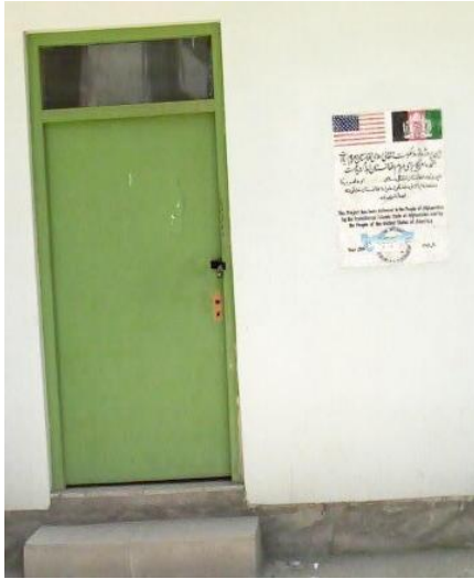
Non-functional toilet facilities with locked door and missing door handle at the Kabul courthouse

OTI and IOM relied for female program implementation, been following a nationwide approach, all women involved in such programming would have moved along a similar trajectory.